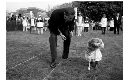
The Annual White House Easter Egg Roll