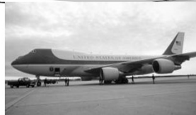
Air Force One