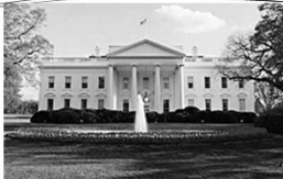
The White House