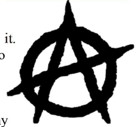
An A inside a circle is the traditional symbol for anarchy.

In an anarchy , nobody is in control—or everyone is, depending on how you look at it. Sometimes the word anarchy is used to refer to an out-of-control mob. When it comes to government, anarchy would be one way to describe the human state of existence before any governments developed. It would be similar to the way animals live in the wild, with everyone looking out for themselves. Today, people who call themselves anarchists usually believe that people should be allowed to freely associate together without being subject to any nation or government. There are no countries that have anarchy as their form of government.